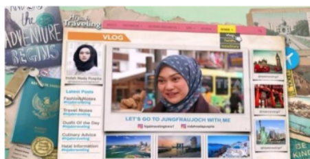
Figure 1 Video of "Jungfrauoch Top of Europe

The writer in finding type of mixed codes used theory according to Suwito (Astuti, 2017). In analyzing the types of code mix the writer classifies mixed code according to linguistic elements such as word, phrase, clause, idiom, baster and repetitive words.