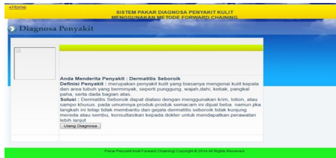
Fig. 4. Diagnosis result