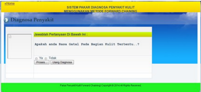
Fig. 3. Consultation page